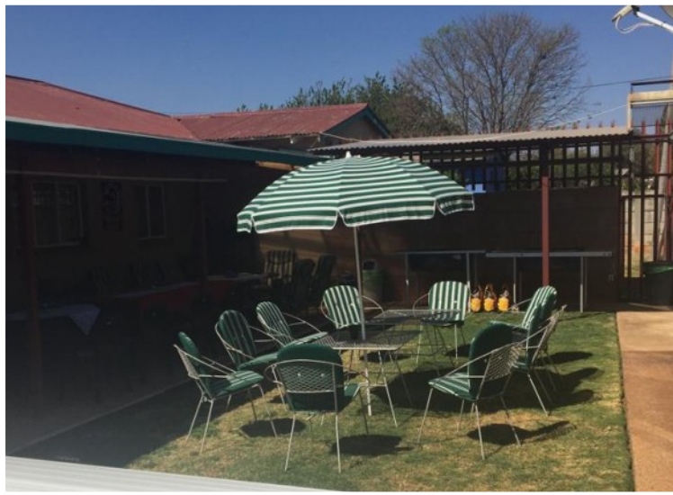
Photo on right & below showing the pre-meeting preparations at the 'Club House' & under the Patio.

The attendance was slightly down this month due to members away on leave, working and sick. The weather was a perfect day for both a meeting and a social braai. The Chapter Members preferred the Monthly Meetings & Social to be held every 2nd Saturday of the month.