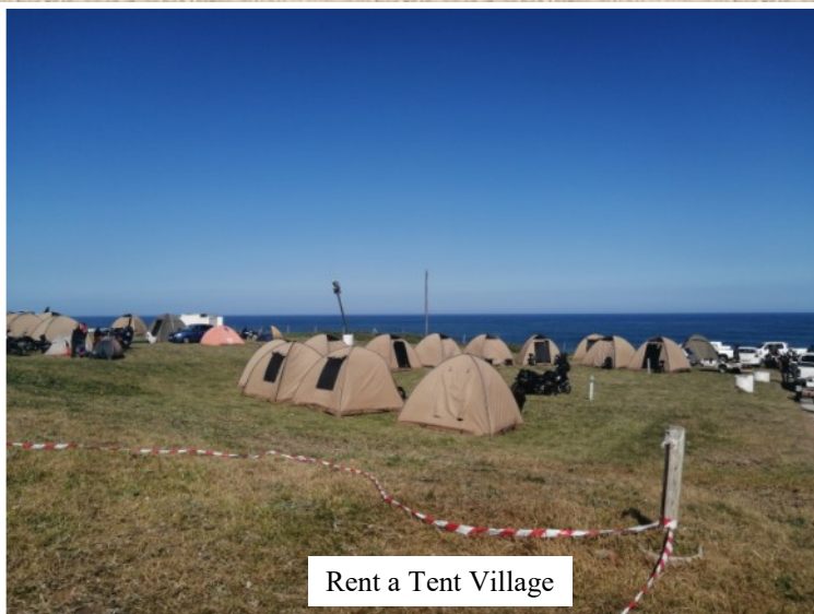
Rent a Tent Village