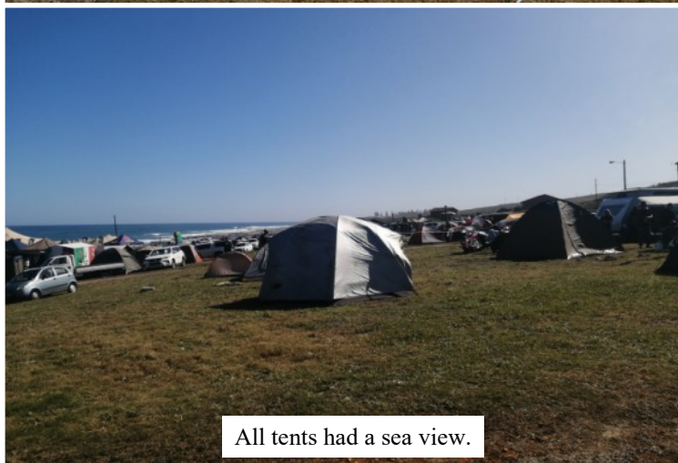
All tents had a sea view.